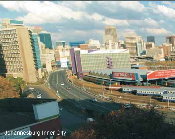
Johannesburg Inner City