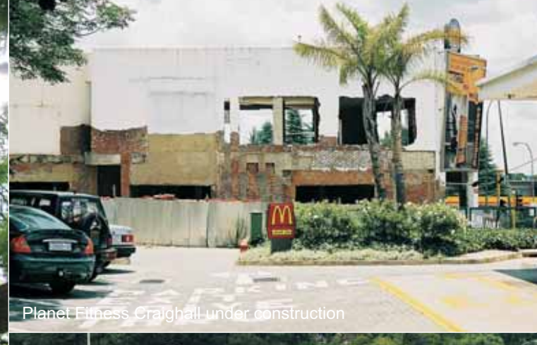
Planet Fitness, Craighall under construction