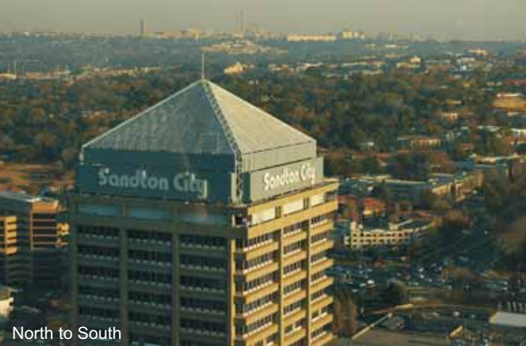
North to South