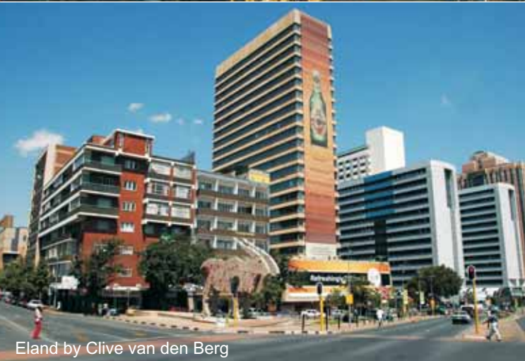
Eland by Clive van den Berg