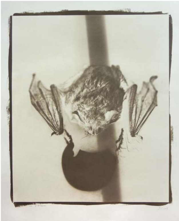
Untitled: Bat 2008 Negative Van Dyke brown hand print on Fabriano 300gsm 71x59cm Negative Size Ed 5 R 18 500.00 (incl. VAT unframed)