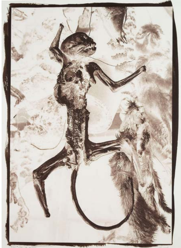
Untitled: Vervet Monkey 2008 Negative Van Dyke brown hand print on Fabriano 300gsm 80x50cm negative size Ed 5 R 18 500.00 (incl. VAT unframed)