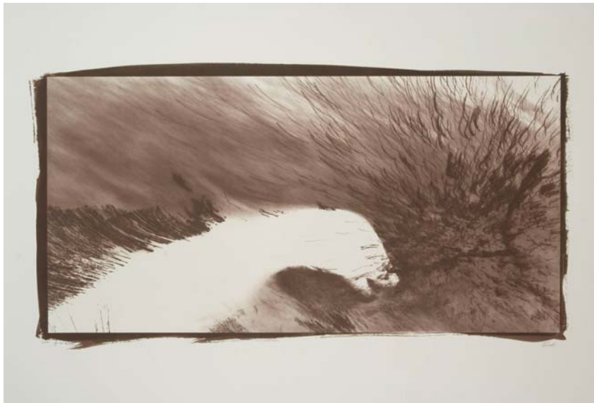
Untitled: Seal 2008 Negative Van Dyke brown hand print on Fabriano 300gsm 40x79cm Negative Size Ed 5 R 18 500.00 (incl. VAT unframed)

Call & Answer - the catalogue (signed and editioned)