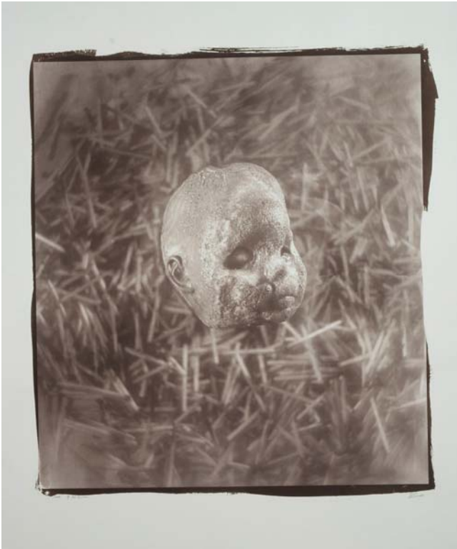
Untitled: Burnt Dolls head 2008 Van Dyke brown hand print on Fabriano 300gsm 66x59cm Negative Size Ed 5 R 18 500.00 (incl. VAT unframed)