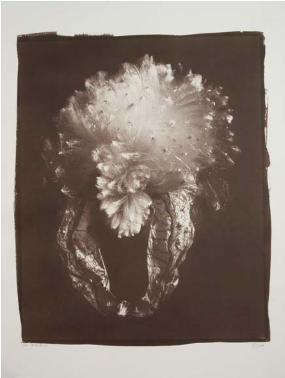
Untitled: Milkweed Pod 2008 Van Dyke brown hand print on Fabriano 300gsm 74x60cm image size Ed 5 R 18 500.00 (incl. VAT unframed)