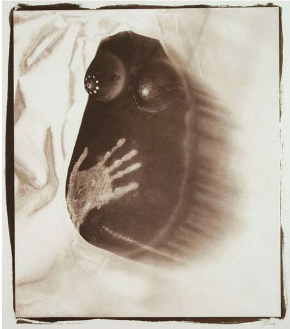
Untitled: Body Mould 2008 Negative Van Dyke brown hand print on Fabriano 300gsm 67x58cm Negative Size Ed 5 R 18 500.00 (incl. VAT unframed)