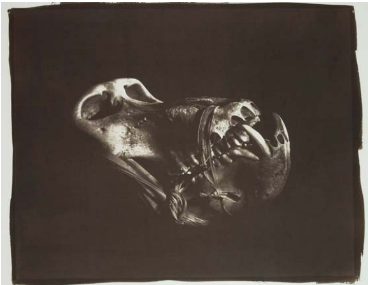
Untitled: Baboon Skull 2008 Van Dyke brown hand print on Fabriano 300gsm 58x78cm image size Ed 5 R 18 500.00 (incl. VAT unframed)