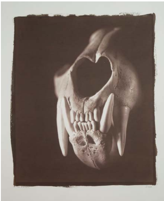
Untitled: Leopard Skull 2008 Van Dyke brown hand print on Fabriano 300gsm 71x59 cm image size Ed 5 R 18 500.00 (incl. VAT unframed)