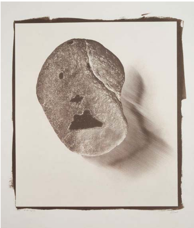
Untitled: Rockface 2008 Negative Van Dyke brown hand print on Fabriano 300gsm 66x58cm Negative Size Ed 5 R 18 500.00 (incl. VAT unframed)