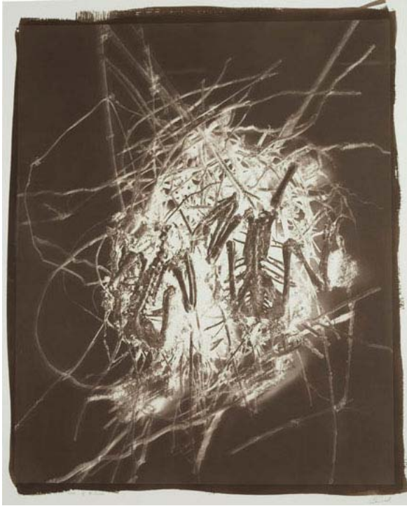
Untitled: Birds Nest 2008 Negative Van Dyke brown hand print on Fabriano 300gsm 75x60cm image size Ed 5 R 18 500.00 (incl. VAT unframed)