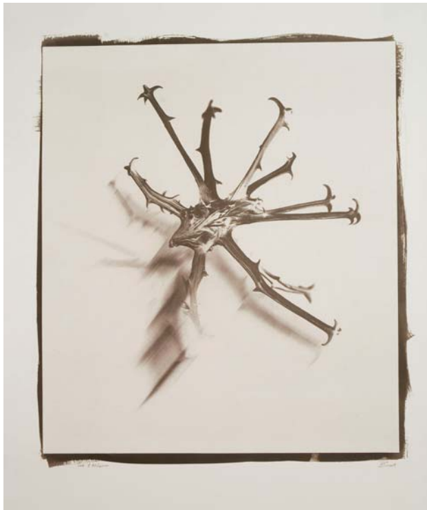
Untitled: Devils Claw 2008 Negative Van Dyke brown hand print on Fabriano 300gsm 68x58cm image size Ed 5 R 18 500.00 (incl. VAT unframed)