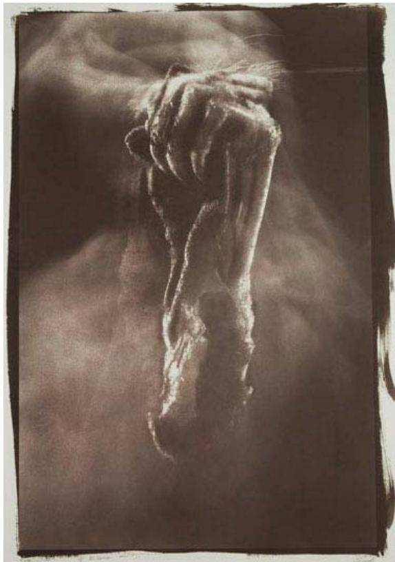
Untitled: Baboon Hand 2008 Van Dyke brown hand print on Fabriano 300gsm 80x51cm image size Ed 5 R 18 500.00 (incl. VAT unframed)