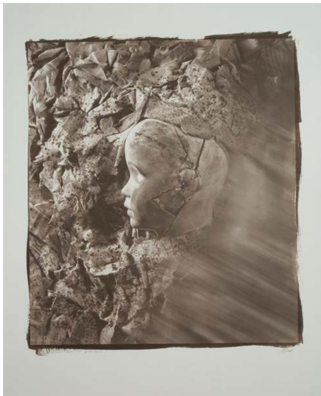
Untitled: Cracked Dolls Head 2008 Van Dyke brown hand print on Fabriano 300gsm 67x58cm Negative Size Ed 5 R 18 500.00 (incl. VAT unframed)