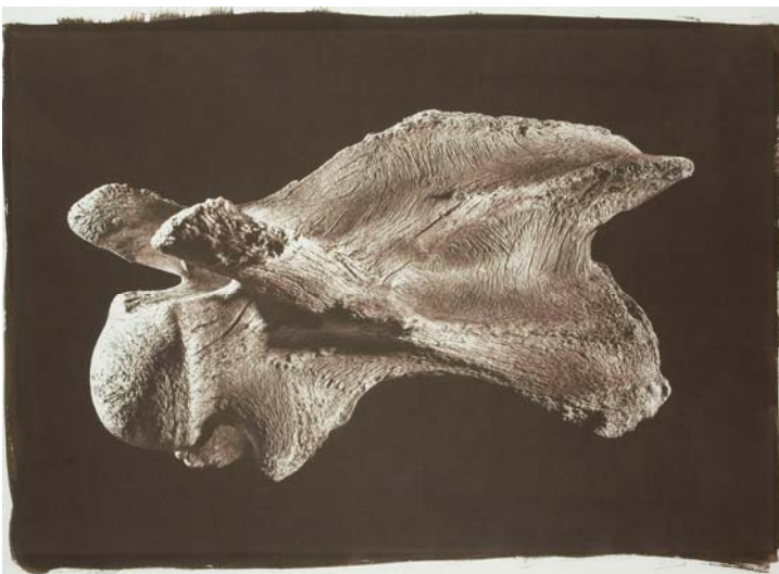
Untitled: Elephant Vertebra 2008 Van Dyke brown hand print on Fabriano 300gsm 58x84cm Negative Size Ed 5 R 18 500.00 (incl. VAT unframed)