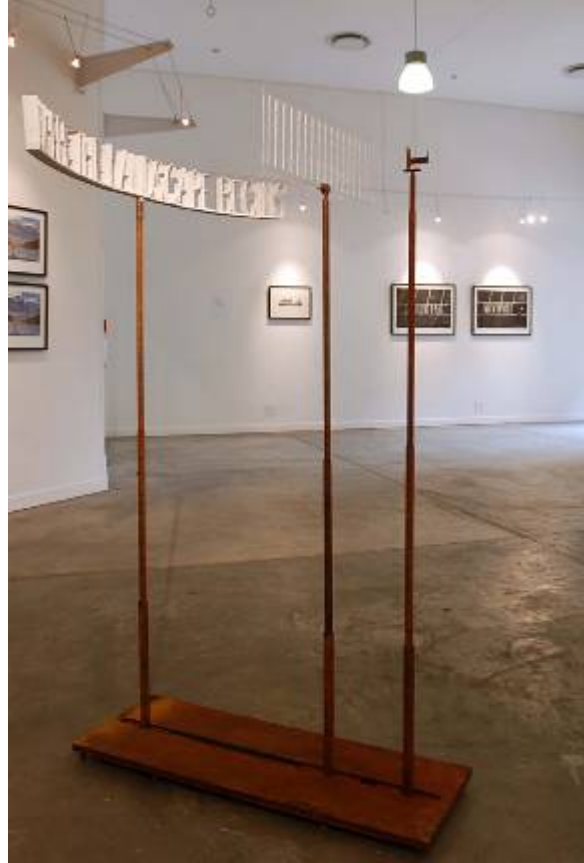
WHERE THE LANDSCAPE BEGINS: 2 2007 Steel, Chalk